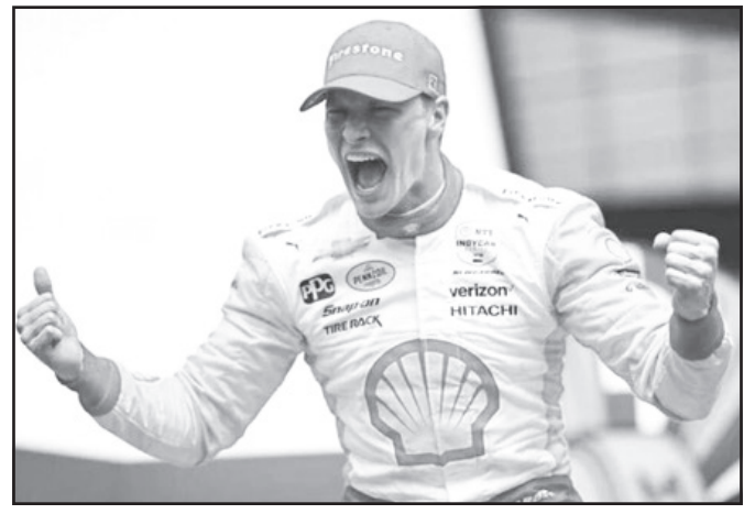
Newgarden Wins Indy 500

Remaining top -10 finishers: 3. Santino Ferrucci, 4. Alex Palou, 5. Alexander Rossi, 6. Scott Dixon, 7. Takuma Sato, 8. Connor Daly, 9. Colton Herta, 10. Rinus VeeKay,